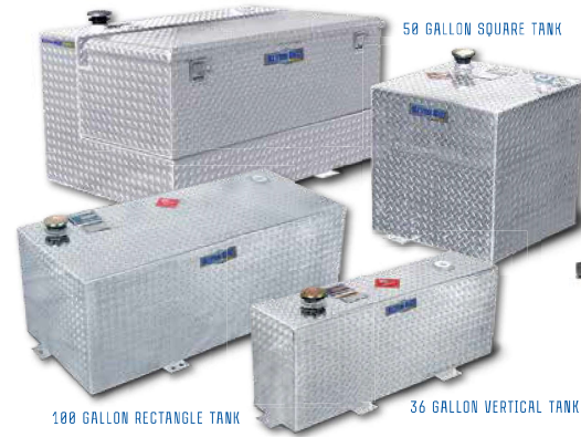
100 GALLON RECTANGLE TANK