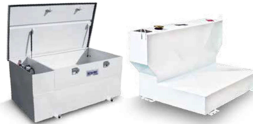
91 GALLON TANK WITH PUMP