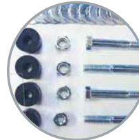
MOUNTING KIT INCLUDED