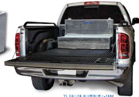
75 GALLON ALUMINUM L-TANK