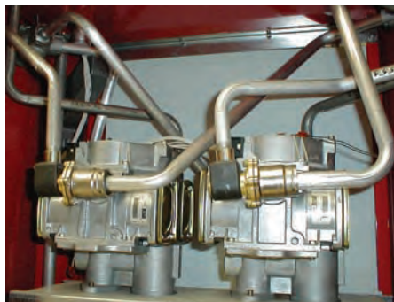
Select SHC Series utilizes two Wayne electronic iMeters manifolded to each hose for superior flow performance