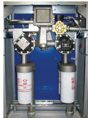
Select UHC Series features high flow Liquid Controls meters, dual internal 40 GPM filters per meter, and a streamlined flow path to provide maximum flow performance and clean fuel