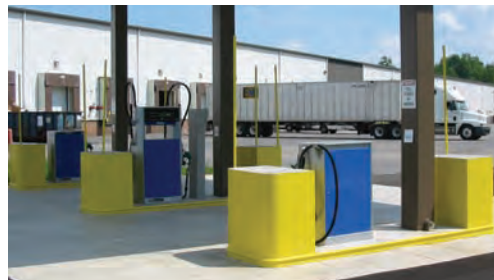
Master and satellite models allow for the convenient and quick fueling of trucks with saddle tanks