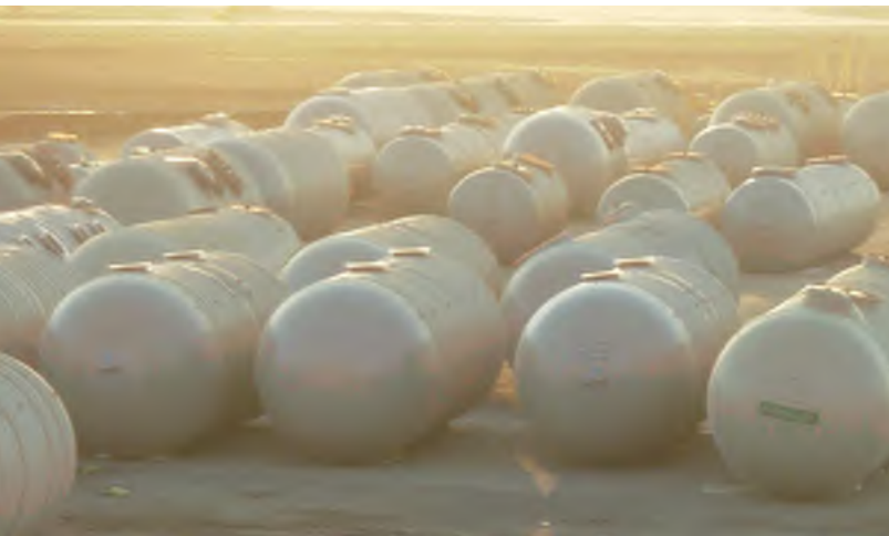
CSI Manufacturing Plant - Bakersfield, CA

Fluid storage today is more challenging and necessary than at any other time in history. Whatever your needs may be, our staff will work with you to determine the best possible solution.