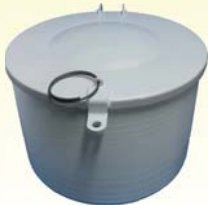
5 Fig. 516 Series Spill Container