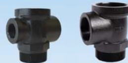
14 Fig. 184 & 184S Series Bushings