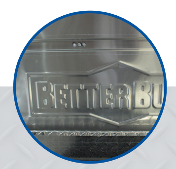
DURABLE LID DESIGN

Industry exclusive locking pull handle latches allow you to lock or unlock your box from either side.