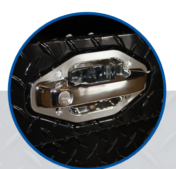
LOCKING CHROME PULL HANDLES

Industry exclusive locking pull handle latches allow you to lock or unlock your box from either side.